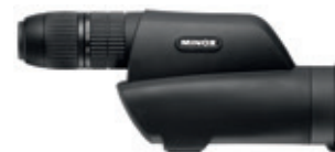
MD 60 Z