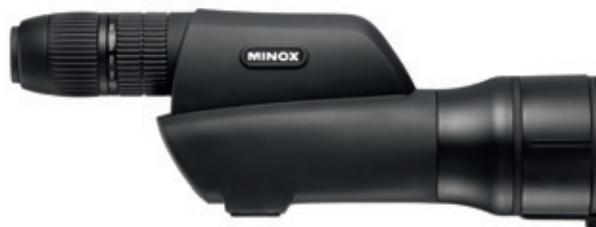
MD 80 Z

The new spotting scope MINOX MD 88 W is equipped with a steplessly adjustable eyepiece with 20 to 60 times magnification thus offering maximum flexibility. The integrated eyepiece permits the observation of far off objects in an amazing magnification and details are experienced in high resolution and image quality.